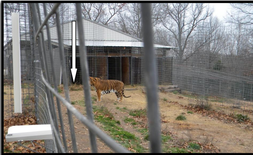
West side of the property in April 2011 before the tent, Merlin's enclosure, (shown with arrow behind tent), and the landscaping.