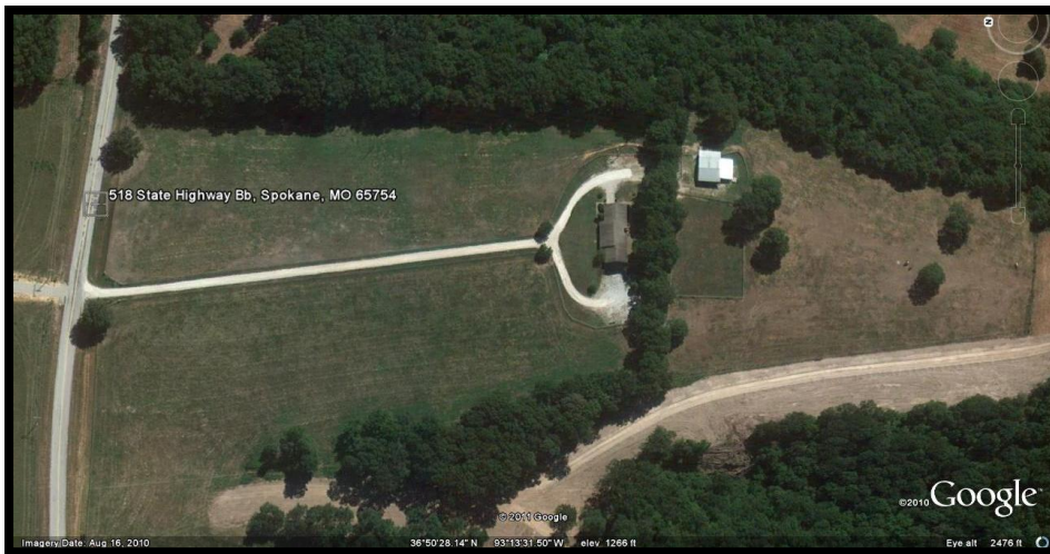
Top picture: When we purchased the land

Hope everyone had a wonderful Thanksgiving and had a chance to spend time with their family and loved ones. As the year closes we wanted to reflect on all the things you have helped us accomplish this year. None of this could have been done without your support and patience. Many of you have waited for us to get to where we are today and with your generous donations and your persistence we have accomplished what some might say, the impossible. Here are some before and after pictures with the help of Google earth: